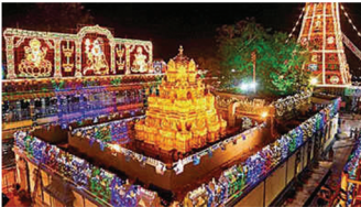
Sri Kanaka Durga Temple