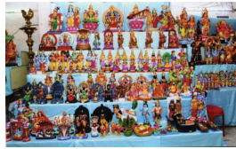
Kondapalli Toys Making