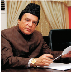
Founder & Chief Promoter