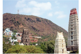
Panakala Narasimha Swamy Temple